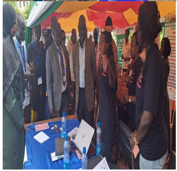
Members Conducting Community Activities